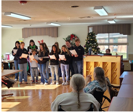
Thank you to the No Names for bringing St. Pius X High School singers out to sing Christmas carols for the residents!