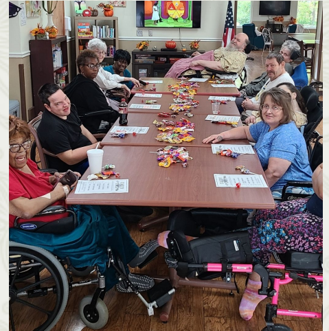
Candy Dice game crew!