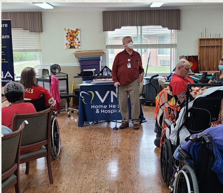
Thank you to VNA Hospice for coming and having a Veterans Day celebration for the residents. All the veterans were given a pin and a certificate in appreciation for their service.